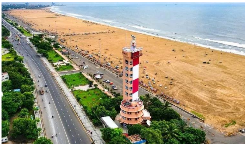
Chennai Marina Beach - 2nd largest beach in the world

Chennai, capital of Tamil Nadu state, southern India, located on the Coromandel Coast of the Bay of Bengal, known as the “Gateway to South India,” Chennai is a major administrative and cultural Centre. Enjoying direct air links from almost every major city from all corners of the globe, Chennai is a grand gateway to India’s fascinating destination. world